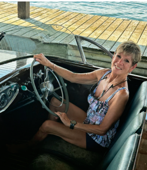
Left: Our adventurous author takes the helm. Below: A historical landmark, the Killarney East Lighthouse was built in 1909 and can be reached on land by hiking a trail that hugs the shoreline of Georgian Bay.

transported us back into the 1950s when the lodge was frequented by the likes of Jackie Gleason, Bob Hope, Al Capone, and Ford Motor company executives. Stuffed bears, wildlife, fish, and wooden Indian figures, all strategically placed, call attention to intricate wood furniture, knotty pine log walls, and 12" pine plank, tongue-and-groove ceilings from which an antique 1913 Evinrude outboard engine hangs. Binoculars from a war ship sit on a picnic table with a schooner suspended overhead while a freestanding brass Kelvin & Hughes compass stands beside a wood ship wheel. It's a nautical museum, with Fuller as a docent, touring through each piece of art and memorabilia. (He also doubles as bartender.)