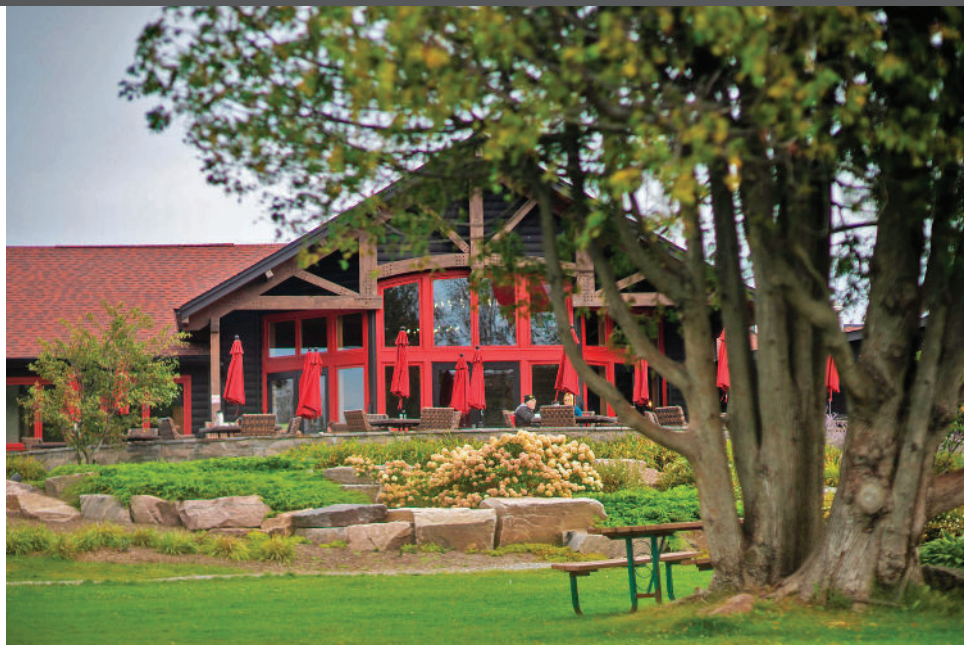
Killarney Mountain Lodge's rooms are all named after local historical figures, locations or events, such as Hole-in-the-Wall, Group of Seven and Silver Peaks.

THE RUGGED WOOD BEAMS, LEOPARD-UPHOLSTERED CHAIRS, AND FURNISHINGS OUT OF A BLACK-AND-WHITE MOVIE TRANSPORTED US BACK INTO THE 1950S WHEN THE LODGE WAS FREQUENTED BY THE LIKES OF JACKIE GLEASON, BOB HOPE, AL CAPONE, AND FORD MOTOR COMPANY EXECUTIVES.