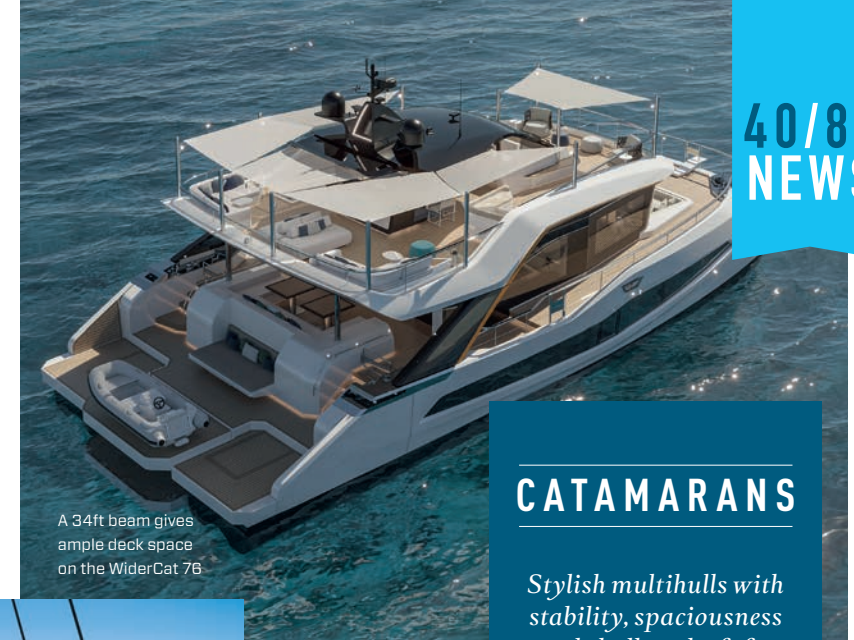
A 34ft beam gives ample deck space on the WiderCat 76

Luca Dini has penned an aggressive non-linear form, which makes this boat stand out but also provides the volume necessary for a bright, woody interior. The owner's main deck cabin has a queen bed and there are three more guest doubles below. Outside space is extensive, with a semi-closed upper deck and twin cockpits (fore and aft). The power train uses traditional diesels and shaft drives but eschews high speeds. wider-yachts.com