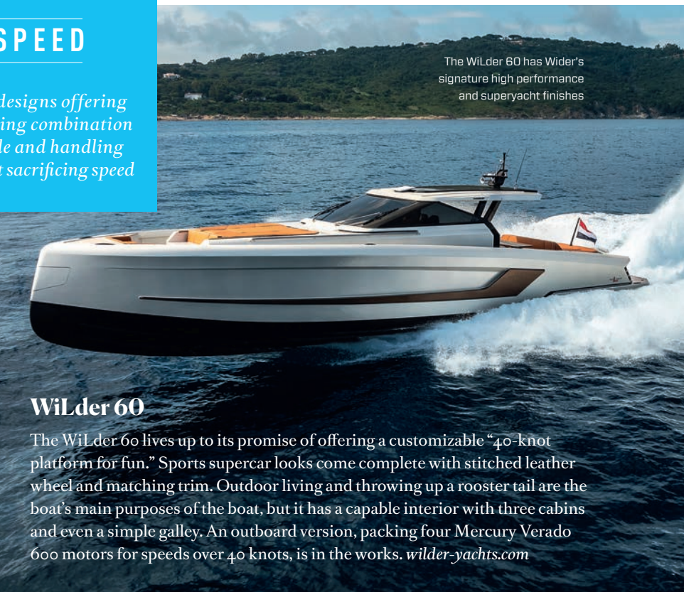
The Wilder 60 has Wider's signature high performance and superyacht finishes

A muscular yacht with powerful performance, the new GTX80 is also stuffed with features. Highlights include a 250-square-foot sundeck with pilot seats that have a ringside view at 34 knots. Fold-down aft wings and a transformer platform facilitate sun worship and watersports, while there's a bar and lots of lounging in the salon. A chic, industrial interior finish gives it the feeling of a big boy's toy below. pershing-yacht.com