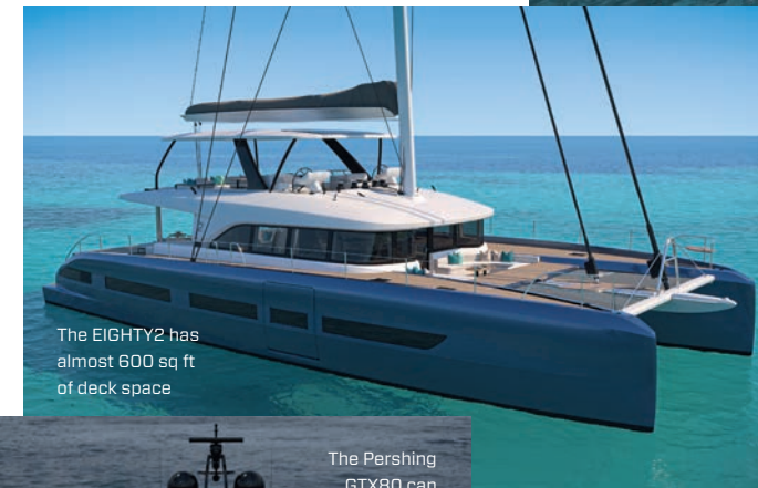
The EIGHTY2 has almost 600 sq ft of deck space

Stylish multihulls with stability, spaciousness and shallow draft for easier exploration