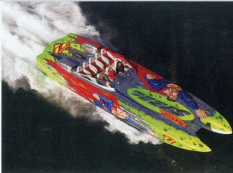
ONE OF THE SKATERS SPEEDS ALONG (ABOVE). THE OUTERLIMITS SPORTS STRIKING PAINT (BELOW).

don't care if it's in the yacht, a boat, or a Sea-Doo!" he says. "The big boat stays in the islands—that's to clear my head and to relax. But the speedboats stay behind my house (on Lake St. Clair, across from Detroit, in Windsor, Canada). I love the convenience—we just drop it in the water, go for a run, put it back on the lift, and jump in the pool!"