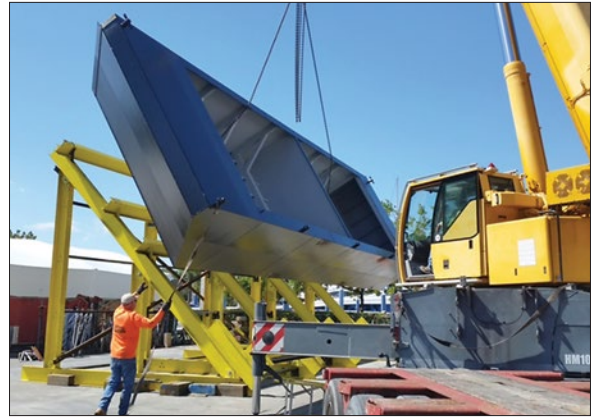
Left —Luxuria’s boxy shape alongside her aerodynamic neighbors at Lauderdale Marine Center raised some eyebrows in the superyacht yard. Right —The boat’s base hull is two barges welded to each other; to hold them together during joining, crews built the custom yellow support beam structure. The yearlong build was a source of curiosity, entertainment, and awe for conventional yard workers and customers.

Like all Florida homes built to code, Luxuria ’s frame is reinforced by steel Simpson Strong-Ties and diagonal metal cross bracing attached to each beam for structural support and to prevent racking. Several United States Department of Agriculture BioPreferred